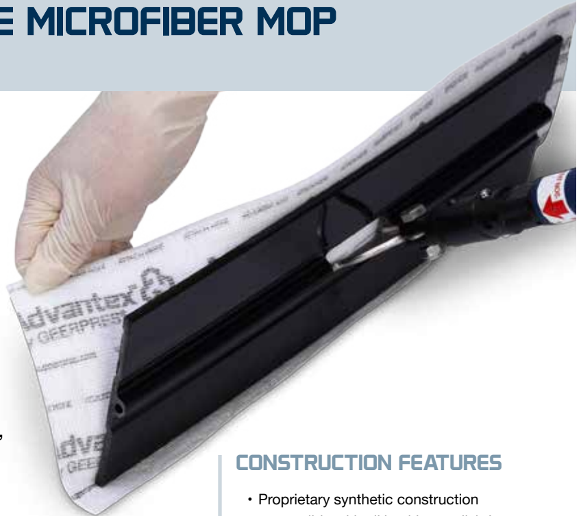
#4832 Advantex® 18" x 5" Disposable Microfiber Mops

Designed for daily floor cleaning in healthcare and cleanroom/laboratory applications, the Advantex® Microfiber Mop has been tested and proven best-in-class for non-quat binding, disinfection application, solution delivery, and reducing chemical utilization and waste.